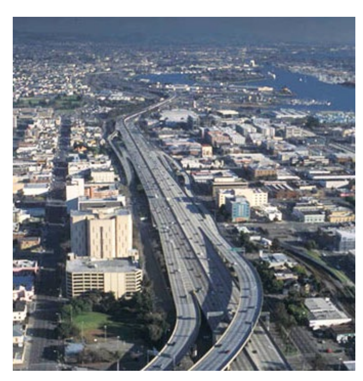
Aerial view of Oakland-Alameda Access Project.