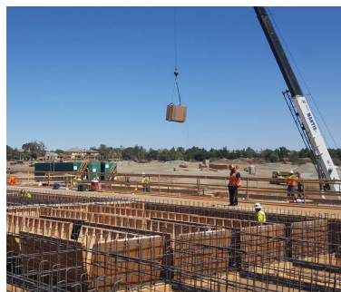
Construction of bridge widening at Arroyo Del Valle.