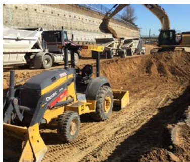
SR-84 Expressway – South Segment.