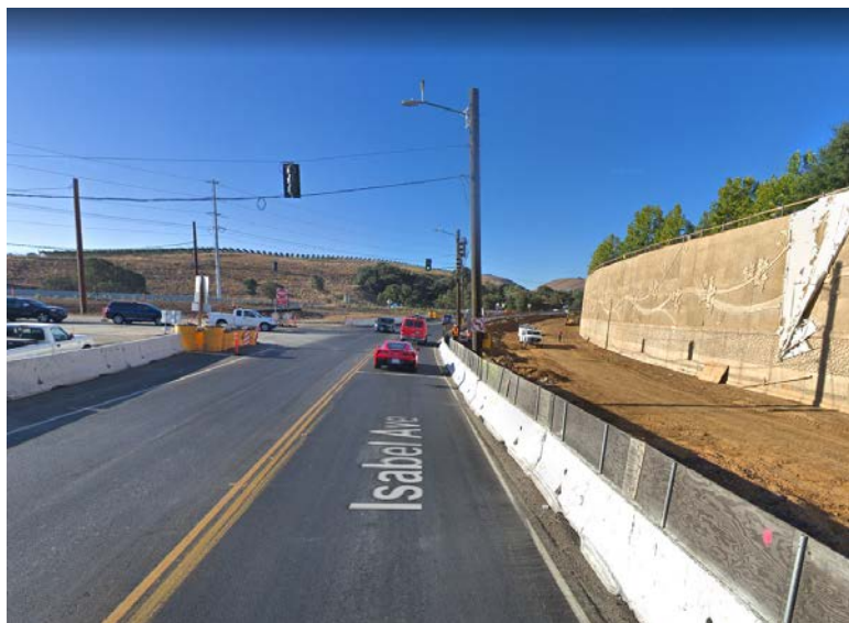
Southbound on Isabel Avenue at Vallecitos Road.