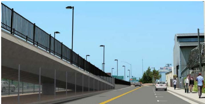
Conceptual rendering of the I-80 Gilman Interchange Improvements project looking north along Eastshore Highway before Gilman Street.