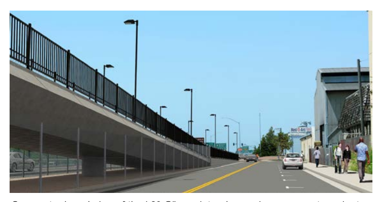
Conceptual rendering of the I-80 Gilman Interchange Improvements project looking north along Eastshore Highway before Gilman Street.