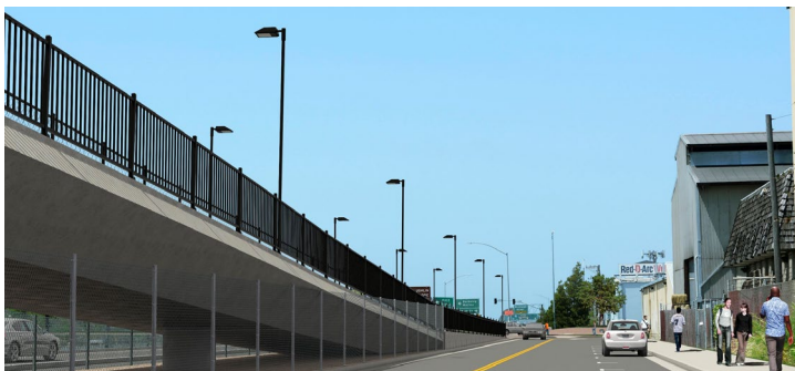
Conceptual rendering of the I-80 Gilman Interchange Improvements project looking north along Eastshore Highway before Gilman Street.