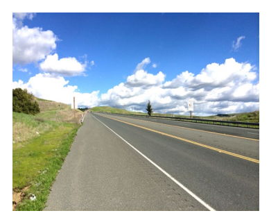
SR-84 looking westbound near Ruby Hill Road.