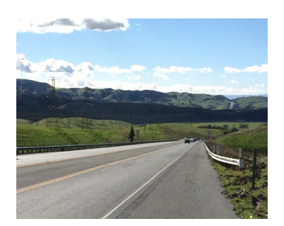
SR-84 looking eastbound near Ruby Hill Road.