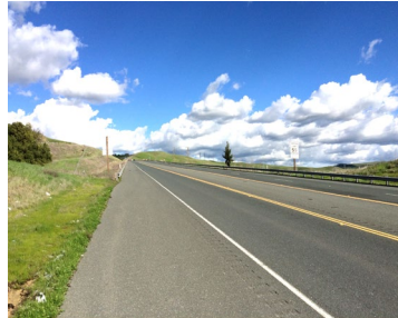
SR-84 looking westbound near Ruby Hill Road.