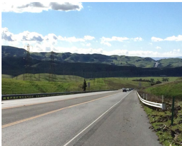
SR-84 looking eastbound near Ruby Hill Road.