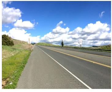
SR-84 looking eastbound near Ruby Hill Road.