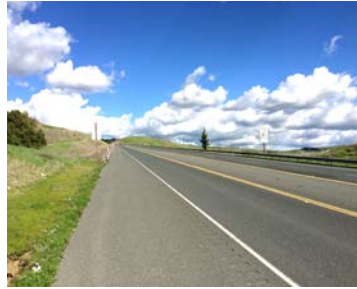
SR-84 looking westbound near Ruby Hill Road.