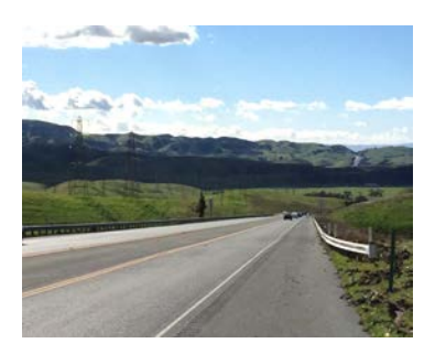
SR-84 looking eastbound near Ruby Hill Road.