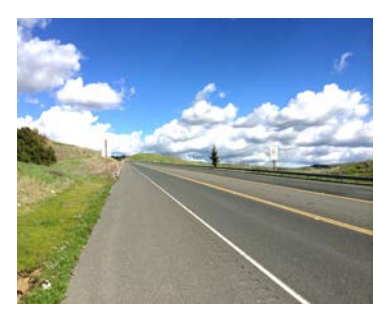
SR-84 looking westbound near Ruby Hill Road.