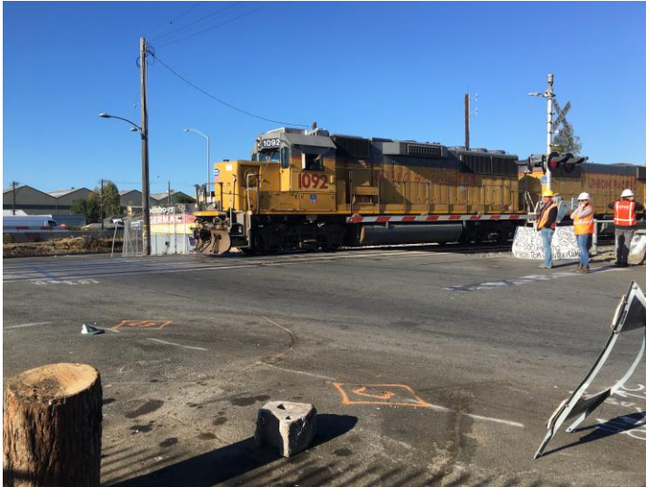
Rail crossing along 37th Avenue in the City of Oakland.