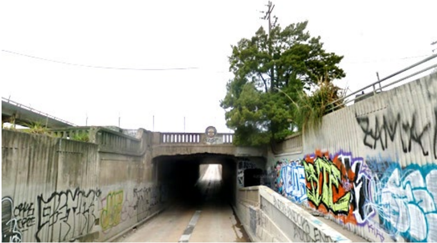
7th Street, approaching Union Pacific Railroad bridge from the east.