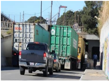
Truck stuck at the 7th Street underpass.