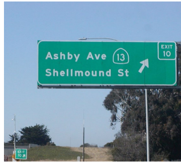
I-80 eastbound Eastshore Freeway approach at the Ashby Avenue exit.