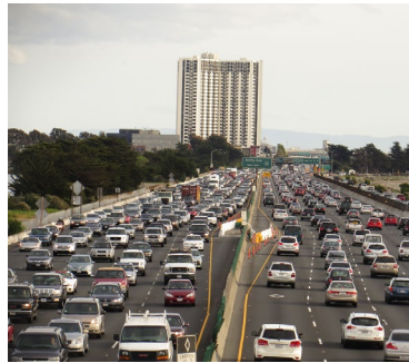
I-80 freeway looking south approaching the Ashby Avenue exit.