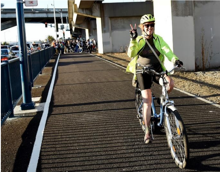
Initial East Bay Greenway segment from Coliseum BART to 85th Avenue (funded by Measure WW, TIGER and BAAQMD).

Current Phase: Preliminary Engineering/Environmental