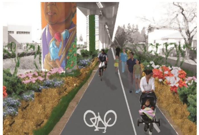
Rendering of East Bay Greenway.

Cities of Oakland, San Leandro and Hayward, Alameda County, AC Transit, Bay Area Rapid Transit and the California Department of Transportation