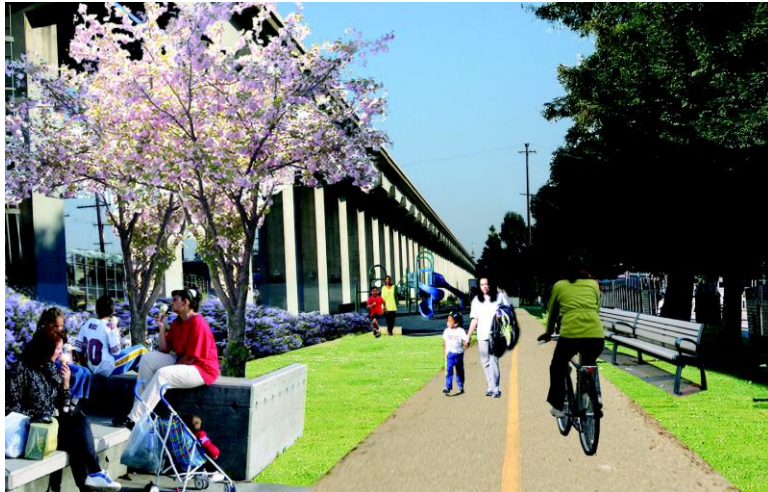
Rendering of East Bay Greenway.