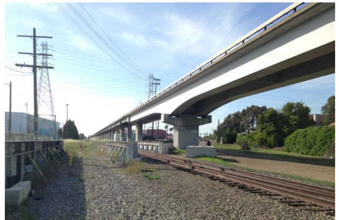
Project corridor in San Leandro south shared by UPRR – an active freight rail line.