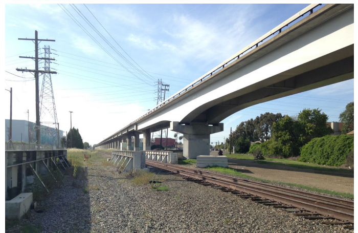
Project corridor in San Leandro south shared by UPRR – an active freight rail line.