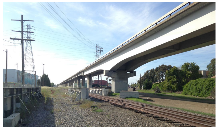
Project corridor in San Leandro south shared by UPRR – an active freight rail line.

** End of appraisal services. Acquisition is TBD.