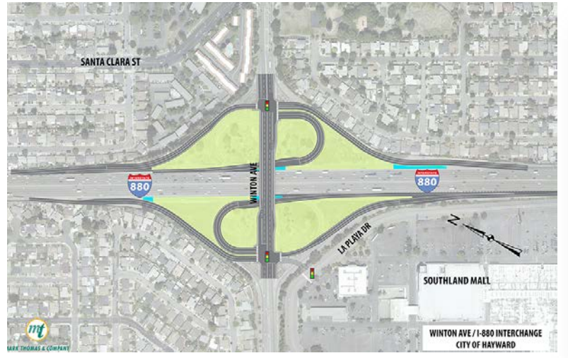
Preliminary interchange geometric at the I-880/Winton Avenue interchange.

Note: Cost estimates for the subsequent work will be determined during the PE/Environmental phase.