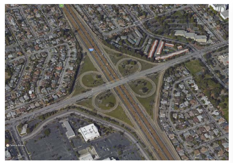
Current interchange at I-880/Winton Avenue.