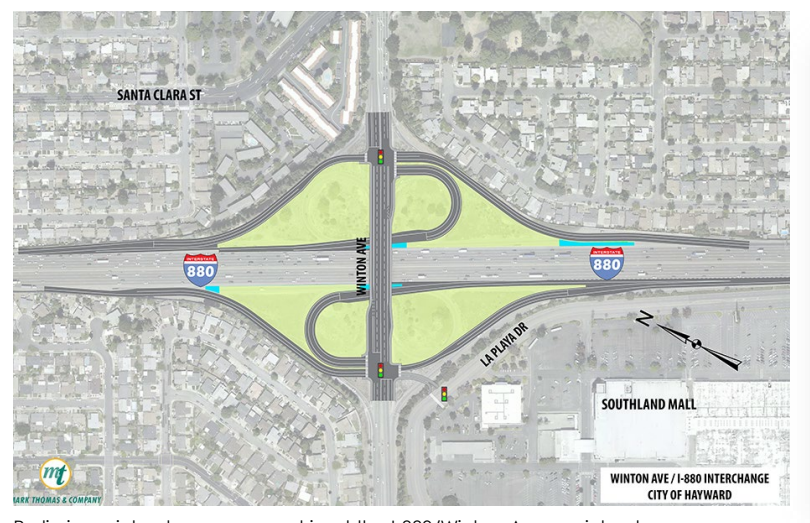
Preliminary interchange geometric at the I-880/Winton Avenue interchange.

Note: Cost estimates for the subsequent work will be determined during the PE/Environmental phase.