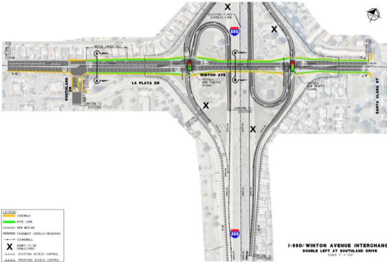
Preliminary interchange geometric at the I-880/Winton Avenue interchange.