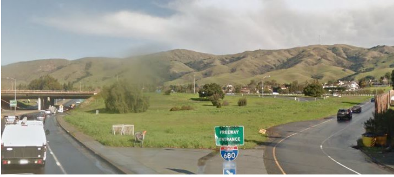
Eastbound SR-262 at the I-680 southbound on-ramp.