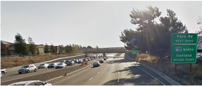
Westbound congestion along SR-262 during the afternoon commute.