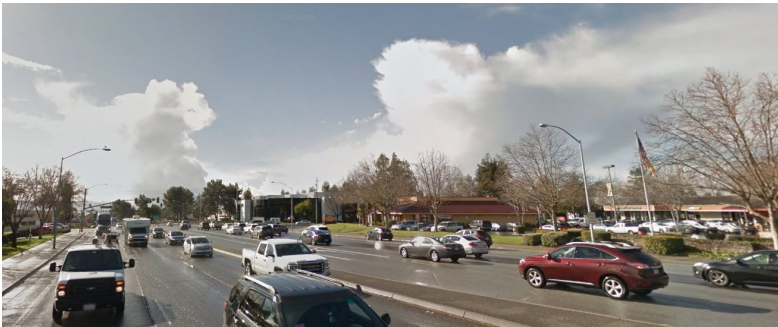
Westbound and eastbound traffic on SR-262 in Fremont.