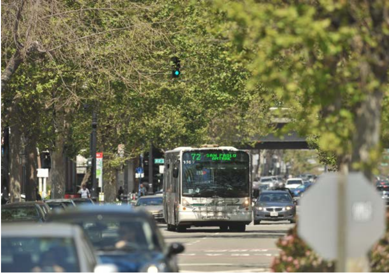
Alameda-Contra Costa Transit District bus traveling on San Pablo Avenue.