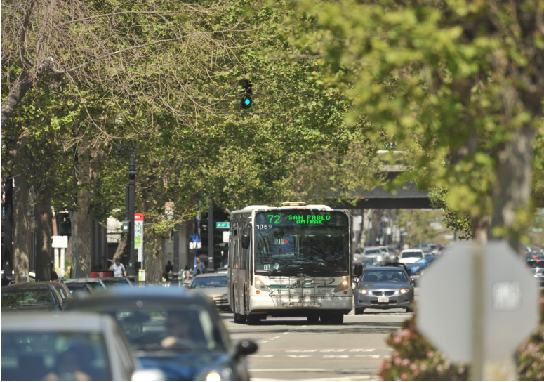
Alameda-Contra Costa Transit District bus traveling on San Pablo Avenue.