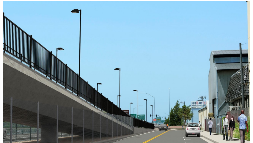
Conceptual rendering of the I-80 Gilman Interchange Improvements project looking north along Eastshore Highway before Gilman Street.