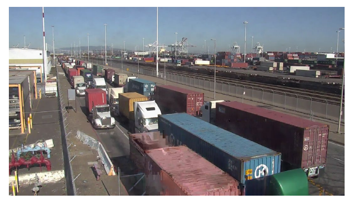
Congestion, bottlenecks, and trucks queuing at the Port of Oakland.