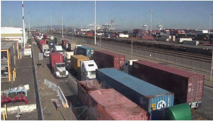
Congestion, bottlenecks, and trucks queuing at the Port of Oakland.