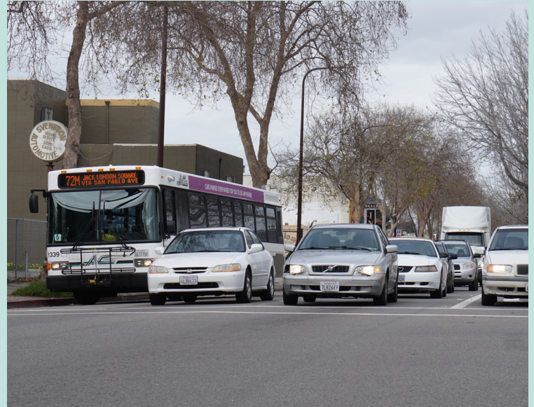
Existing Conditions on San Pablo Avenue

Near-term safety and transit improvements are planned for construction as quickly as possible.