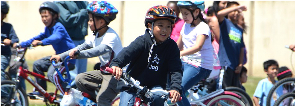
Thousand of students biked to school on Bike to School Day, May 9, 2018.