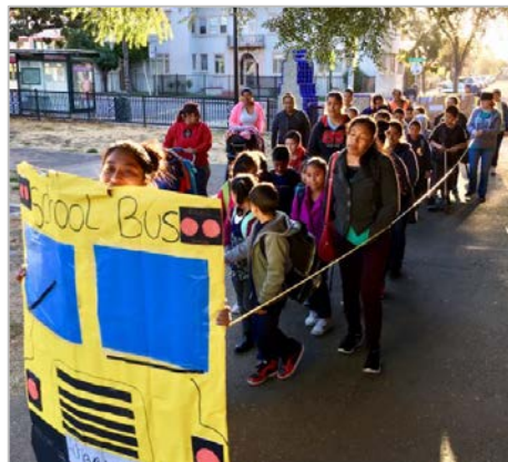
Students walk together in a Walking School Bus at Achieve Academy in Oakland, Calif.