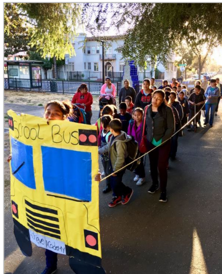
Students walk together in a Walking School Bus at Achieve Academy in Oakland, Calif.