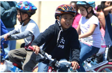
Thousand of Alameda County students participate in countywide events each year, including International Walk and Roll to School Day, the Golden Sneaker Contest, and Bike to School Day.