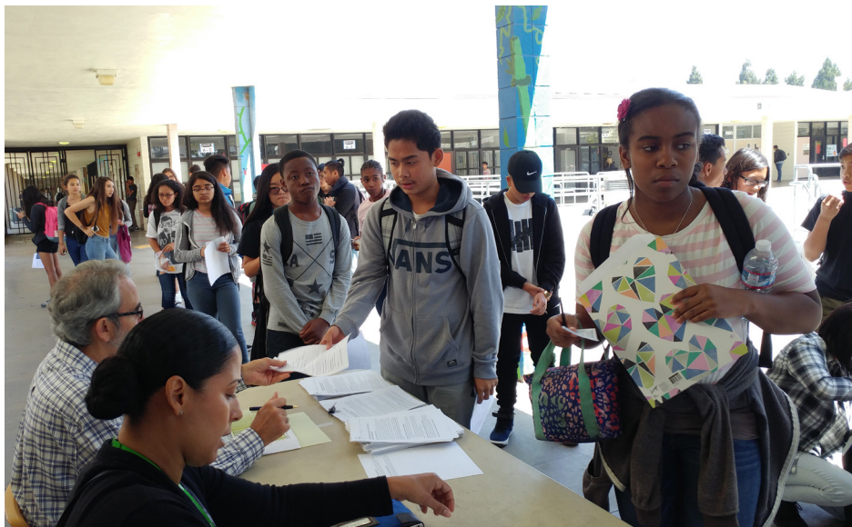
Students registering for the STPP program in August 2016.

Several different models were evaluated during the three-year pilot which account for different transit options, geographies and economic conditions throughout the County. In May 2016, the Commission approved the first year program design. In March 2017, the Commission approved the second year program design. The program design for the third and final year of the pilot was approved by the Commission in February 2018. Two program models (Free/Universal and Free/Means-Based) were being assessed in Year Three.