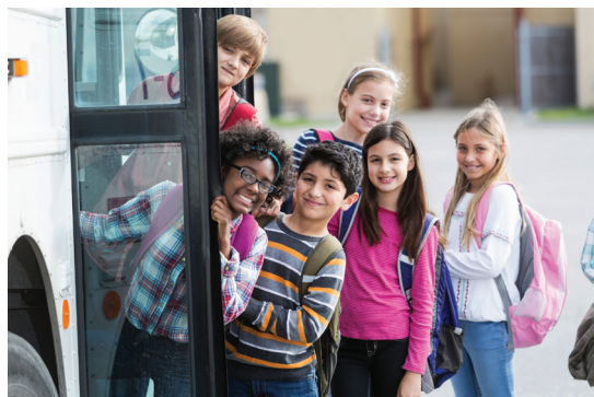
Students boarding a bus in Alameda County.

The program was implemented from August 2016 through July 2019, and several pilot program models have been tested during this time to evaluate the best future options for Alameda County. In March 2016, the Commission approved a site selection framework and a shortlist of 36 school sites that are eligible during the three-year pilot program. Throughout this process, feedback was solicited from interested stakeholders.