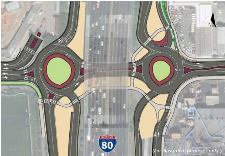
Overlay of the roundabouts at the project location.