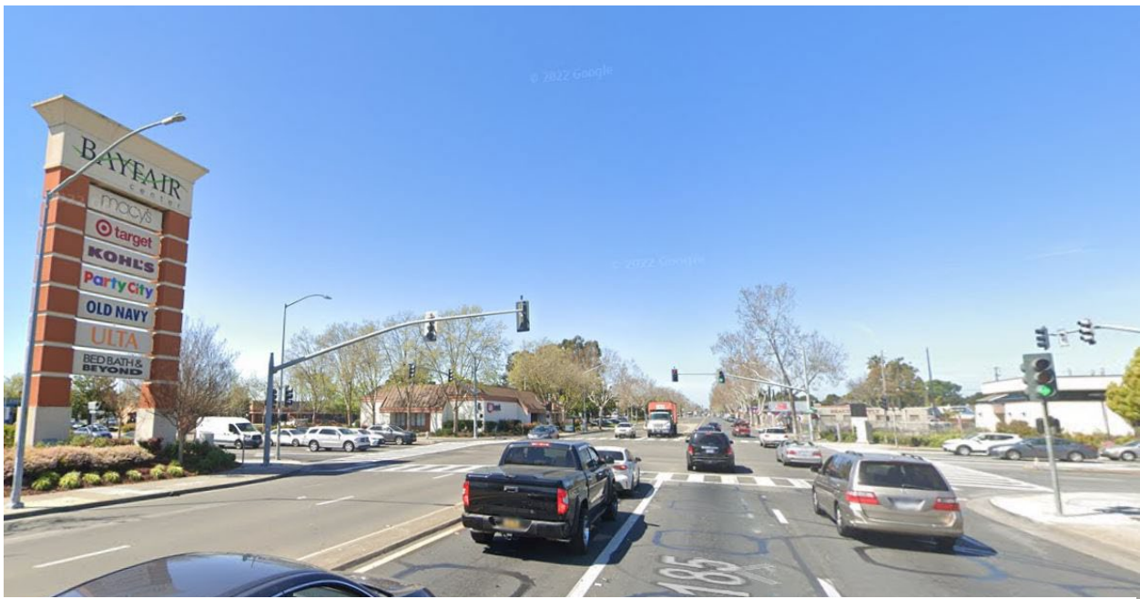
H-25 | E14 th Street at Fairmont Street in San Leandro: There are no bike protected intersections within the corridor. Safety would be improved at busy intersections like E14 th and Fairmont Drive