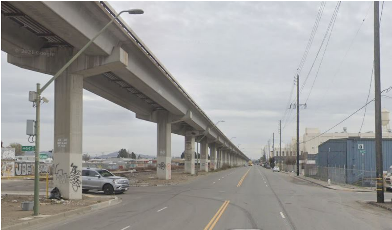
H-10 | San Leandro Street at 54 th Avenue in Oakland: There are no marked crosswalks for long distances on San Leandro Street – pedestrians and cyclists must cross four lanes of traffic with no