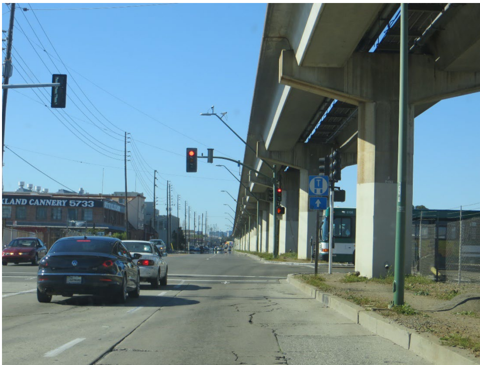
H-9 | San Leandro Street at Seminary Avenue in Oakland: There is a lack of pedestrian and bicycle facilities for long stretches of San Leandro Street, and no protected bicycle facilities within the corridor, except the constructed Segment 7A multi-use path from 75 th to 85 th Avenues