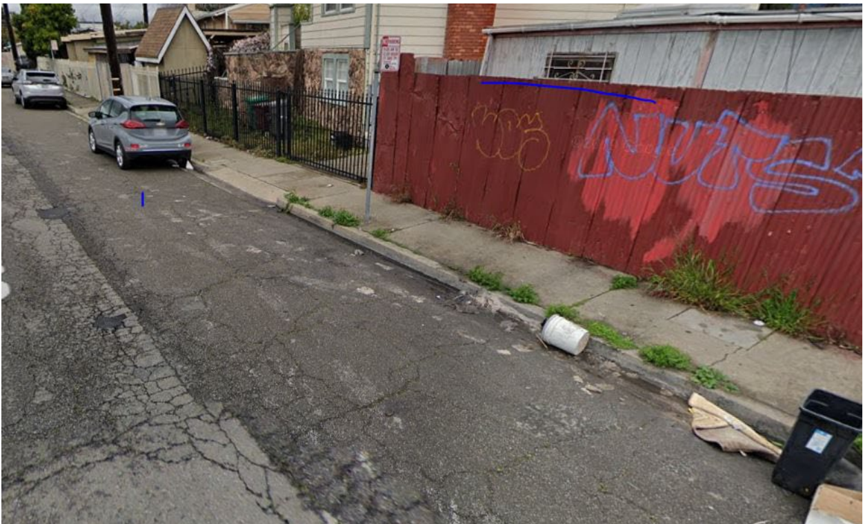
H-19 | San Leandro Street at Blenheim Street in Oakland: Pedestrians and cyclists must contend with narrow sidewalks and poor pavement conditions