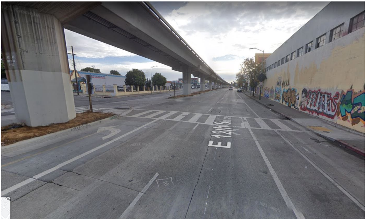
H-7 | E12 th Street at 22nd Avenue in Oakland: Bike lanes are discontinuous & require cyclists to weave across multiple lanes to make left turns