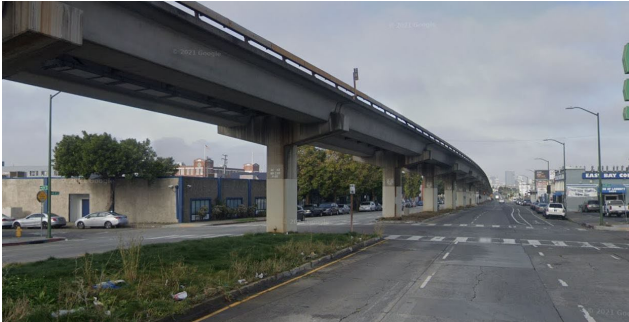
H-8 | E12 th Street at 25 th Avenue in Oakland: Unprotected left turns on E12 th Street are aggravated by poor sight distance due to the presence of the BART aerial structure columns