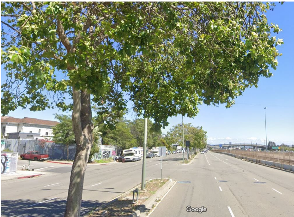
H-5 | E8 th Street at 12 th Avenue in Oakland: Unprotected left turns where turning vehicles must attempt to scan for a gap in opposing traffic and identify any crossing bicyclists and pedestrians