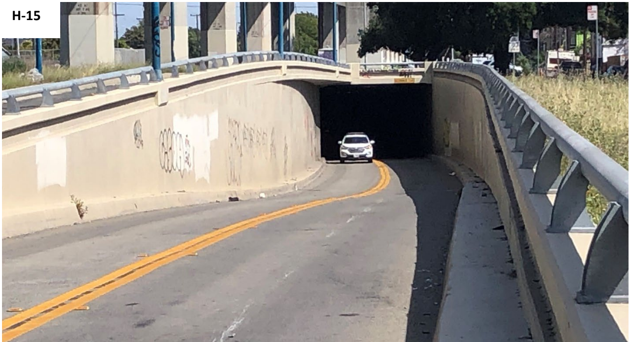
H-14-15 | San Leandro Street Underpass at 105 th Avenue in Oakland: There is a lack of signage to warn pedestrians and cyclists of unsafe road conditions, and no direct route southbound on San Leandro Street