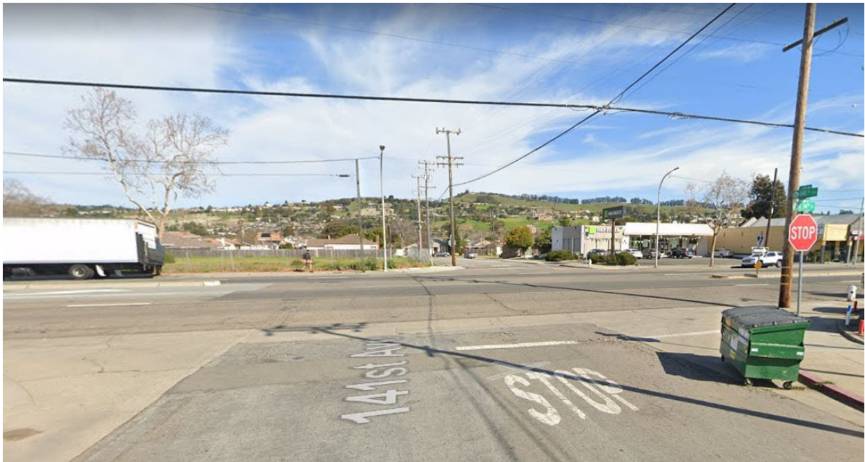
H-21 | E 14 th Street at 141 st Avenue in San Leandro: Offset intersections add complexity to crossing maneuvers