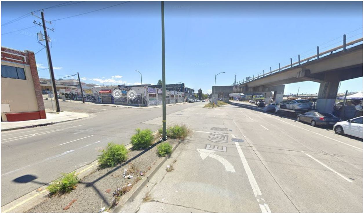
H-6 | E12 th Street at 19 th Avenue in Oakland: Lack of marked pedestrian crossings for long stretches of E12 th Street leads to jaywalking and unsafe conditions