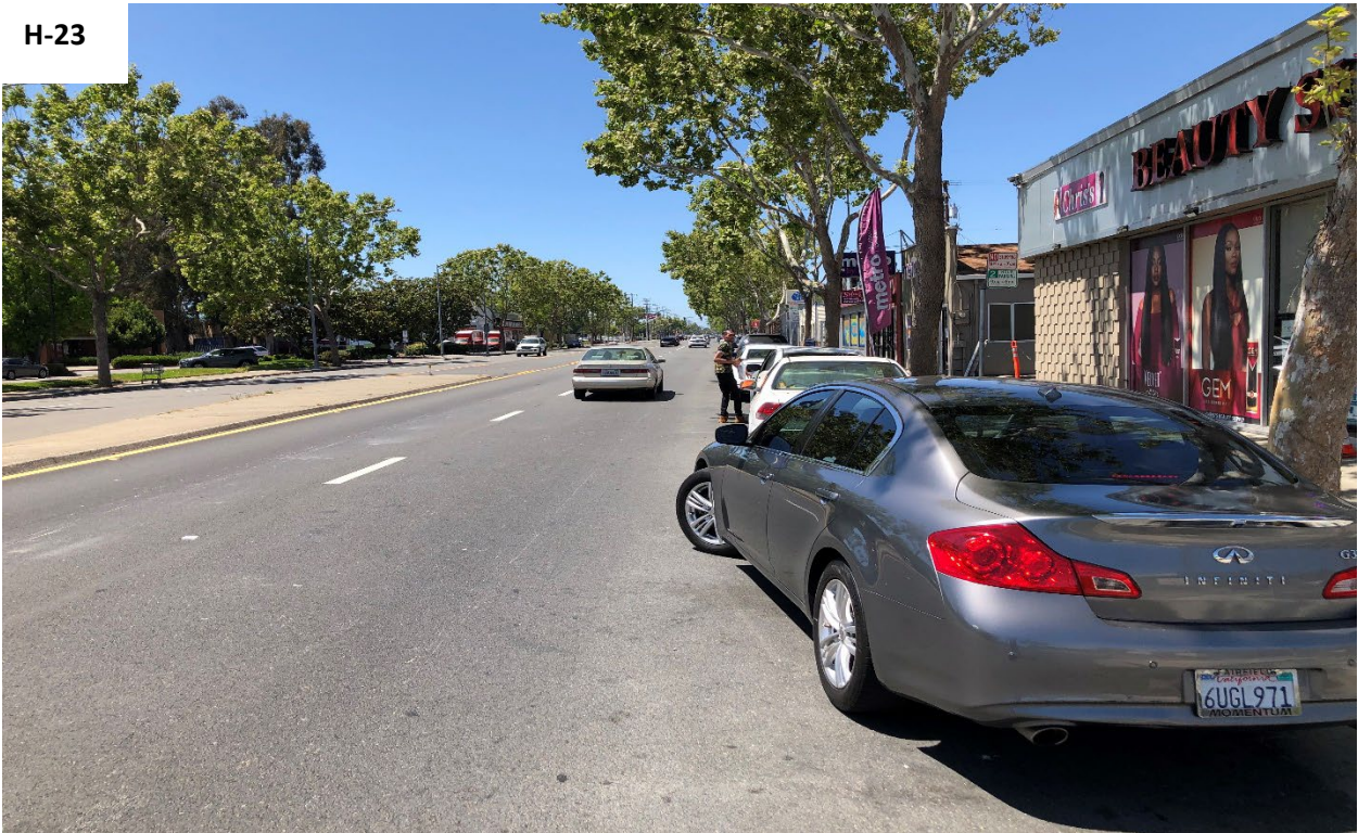
H-22-23 | E14 th Street in San Leandro: A lack of protected bike facilities within the corridor means cyclists must contend with car door openings and parking maneuvers