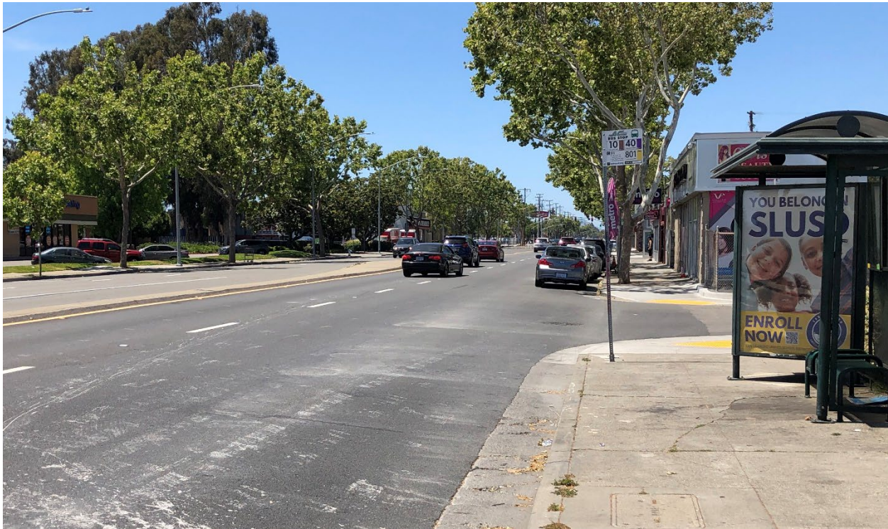
H-24 | E14 th Street in San Leandro: There is a lack of crossing opportunities along East 14th, which is in the heart of a commercial district: there are locations where pedestrians must walk up to a quarter mile out of their way to get to a marked crosswalk