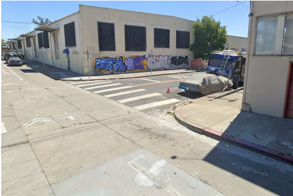
H-3 | E10 th Street at 8 th Avenue in Oakland: Several blocks on E10 th Street have no curb ramps or are otherwise not ADA compliant