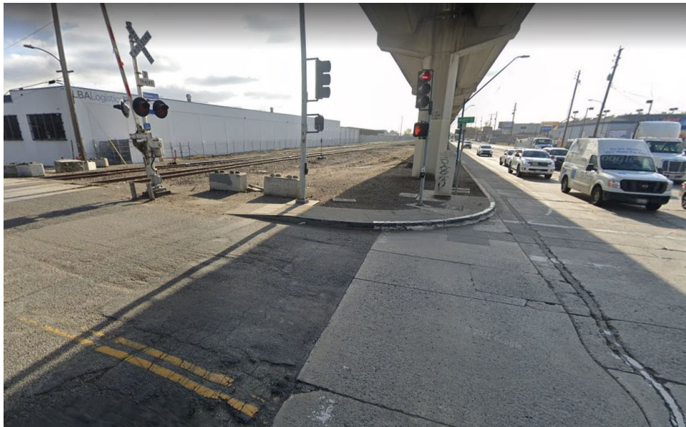
H-11 | San Leandro Street at 85 th Avenue in Oakland: Paths of travel along and across San Leandro Street are discontinuous