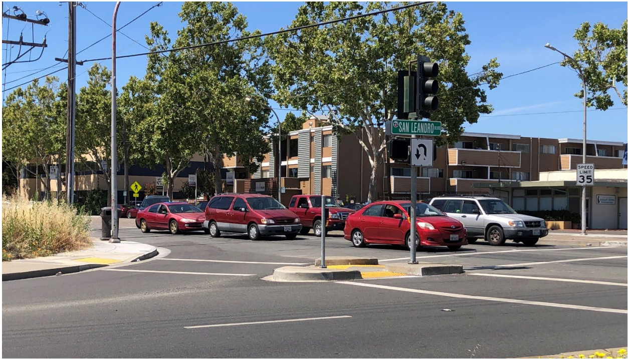
H-20 | San Leandro Boulevard at Washington Street in San Leandro: Free right turns cause conflicts with cyclists