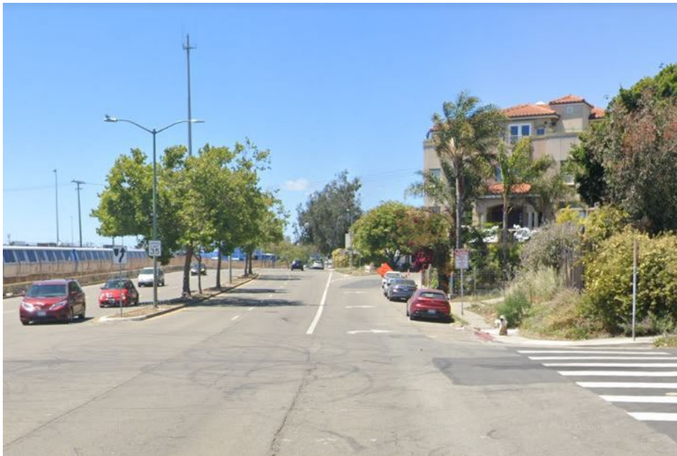
H-4 | E8 th Street at 10 th Avenue in Oakland: Cyclists traveling northbound have to weave across lanes to avoid getting trapped at the right-only lane