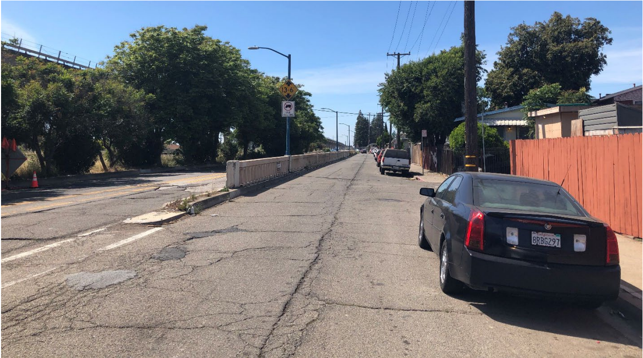
H-18 | San Leandro Street at Blenheim Street in Oakland: Narrow pavement widths do not allow for safe passing of bicyclists