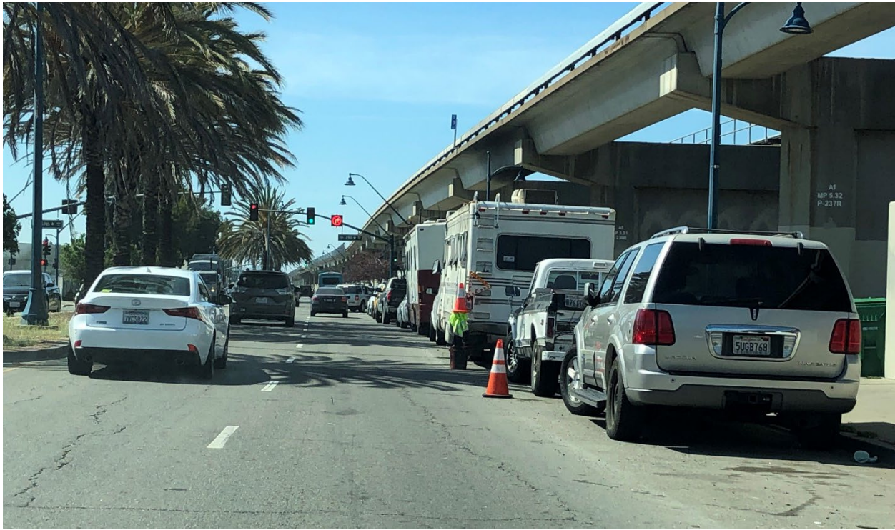
H-12 | San Leandro Street south of 69 th Avenue in Oakland: There is no separation of bikes from traffic north of Coliseum BART