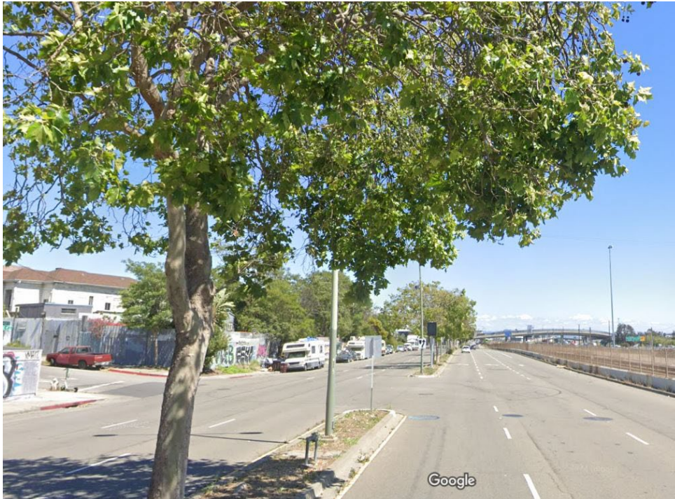
H-4 | E8 th Street at 11 th Avenue in Oakland: Cyclists must contend high speeds and volumes on E8 th Street (13,700 vpd/48 mph)