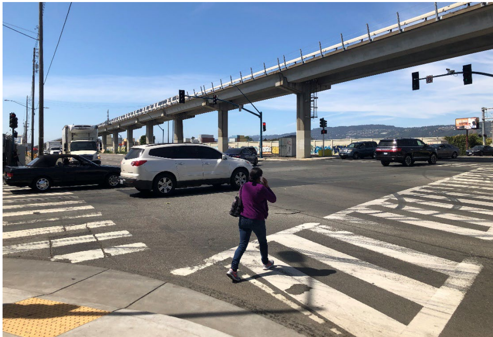
H-13 | San Leandro Street at 98 th Avenue in Oakland: There are long crossings with no pedestrian refuge or curb bulbs