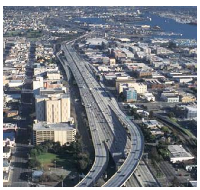
Aerial view of Oakland Alameda Access Project.