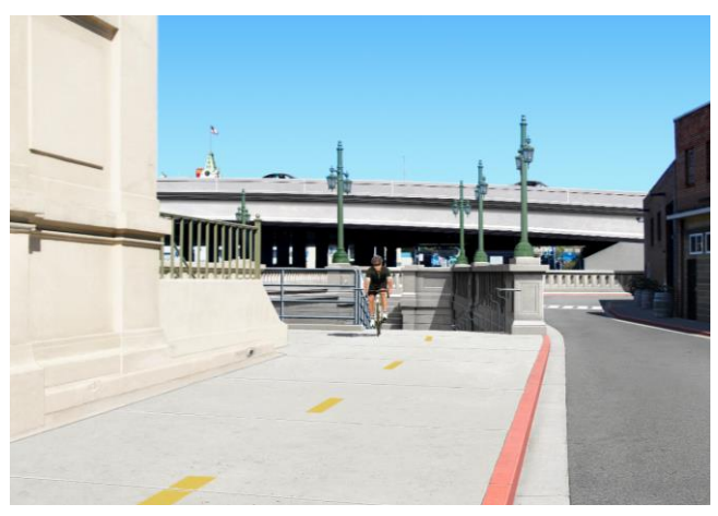
Rendering of view at Harrison Street with bicycle lanes.