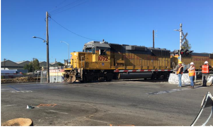
Rail crossing along 37th Avenue in the City of Oakland.