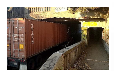
Existing multi-use path and damage to the 7th Street underpass.