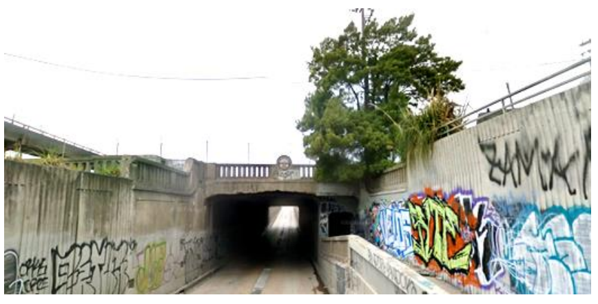
7th Street, approaching Union Pacific Railroad bridge from the east.