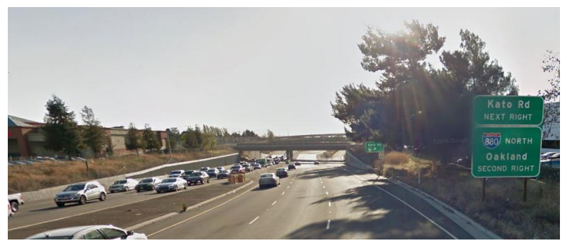
Westbound congestion along SR-262 during the afternoon commute.