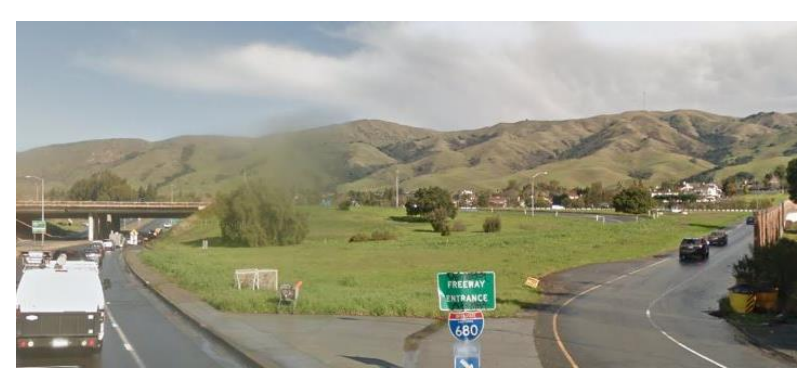
Eastbound SR-262 at the I-680 southbound on-ramp.