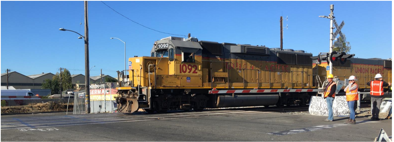
Rail crossing along 37th Avenue in the City of Oakland.