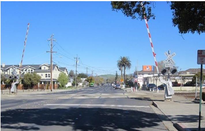
Rail crossing on L Street in the City of Livermore.