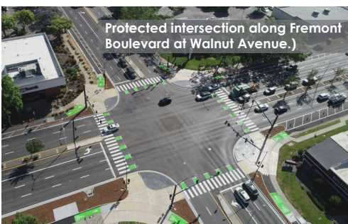
Protected intersection along Fremont Boulevard at Walnut Avenue.

In Fremont, the protected intersection improvements along Fremont Boulevard at Grimmer Boulevard/Eugene Street and at Walnut Avenue are scheduled for completion this month. Featuring high visibility crosswalks, enlarged curb returns, traffic signal upgrades, intersection analytics systems, video-based traffic and bicycle detection, and sidewalk level bikeways, these intersections provide all ages and abilities connections to adjacent Class IV bikeways. They are part of the larger