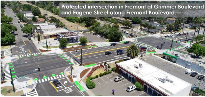
Protected intersection in Fremont at Grimmer Boulevard and Eugene Street along Fremont Boulevard.

Fremont Boulevard Multimodal Corridor Improvements that, as a whole, connect hundreds of affordable housing units to regional transit, local schools, commercial and employment centers, recreational