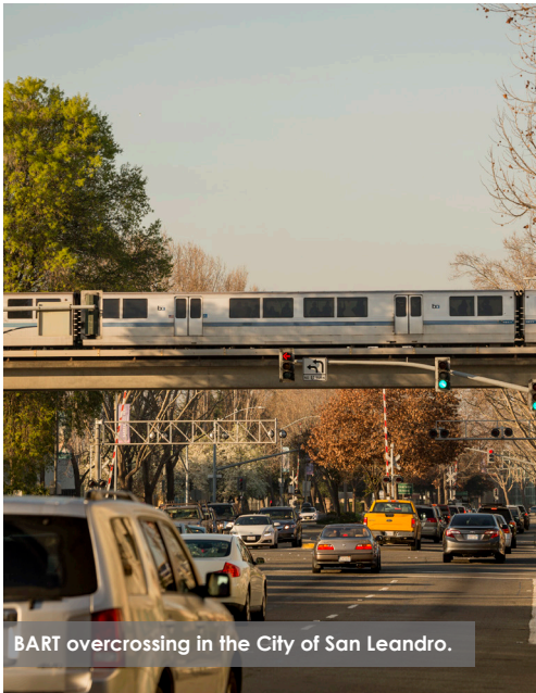
BART overcrossing in the City of San Leandro.

More information about this and other Alameda CTC projects can be found on Alameda CTC's Projects webpage .