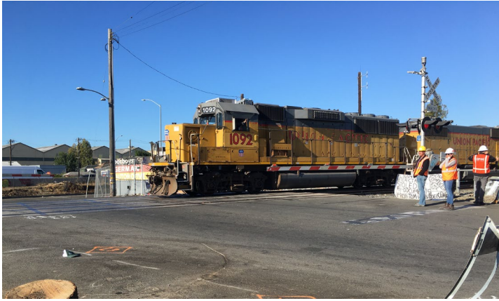
Rail crossing along 37th Avenue in the City of Oakland.