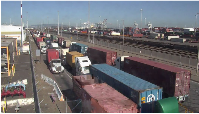
Congestion, bottlenecks, and trucks queuing at the Port of Oakland.