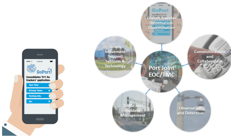
GoPort mobile application.