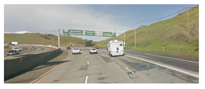
I-680 northbound approaching the SR-84 off-ramp in Sunol.

Note: Funding sources for Phase 1 can be found on the Phase 1 fact sheet.