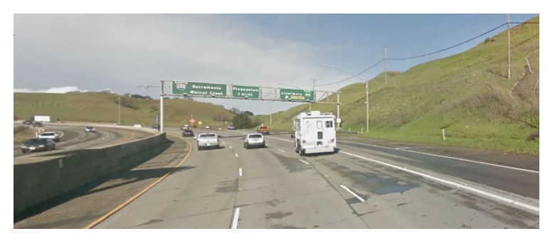
I-680 northbound approaching the SR-84 off-ramp in Sunol.