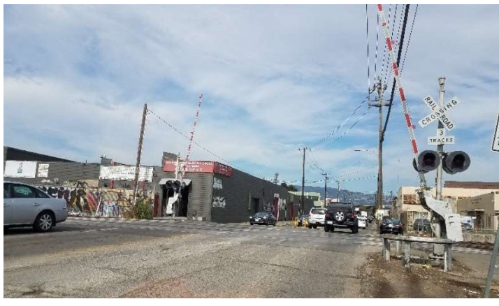
Northeast approach to the rail crossing along High Street in the City of Oakland.

Note: Information on this fact sheet is subject to periodic updates.