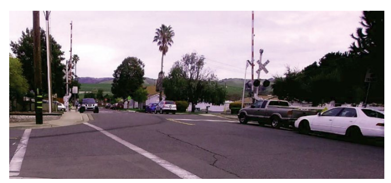
Northbound approach to the rail crossing on H Street in Union City.

Note: Information on this fact sheet is subject to periodic updates.