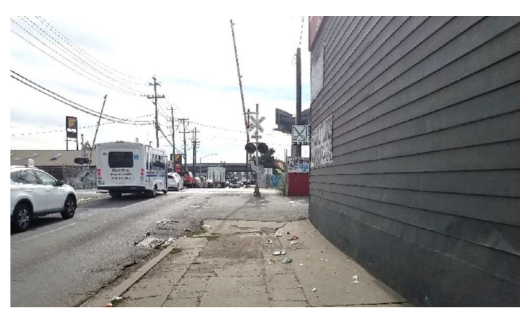
Southwest approach to the rail crossing along High Street in the City of Oakland.

Alameda CTC, Alameda County, the cities of Oakland and Union City, the California Public Utilities Commission, Union Pacific Railroad, and Caltrans