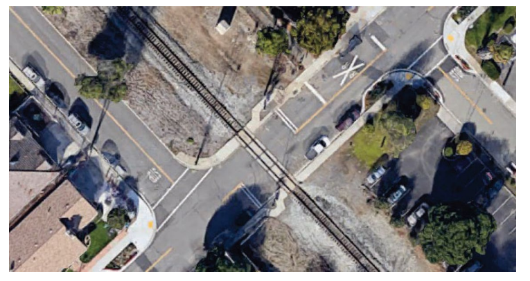
Aerial view of the rail crossing on H Street in the City of Union City.