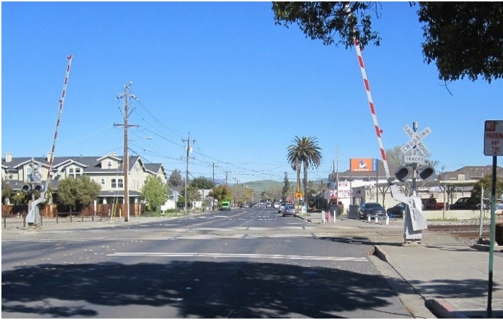
Rail crossing on L Street in the City of Livermore.