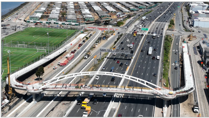
Bicycle and pedestrian overcrossing that is Phase 1 of the I-80 Gilman Interchange Improvements project.