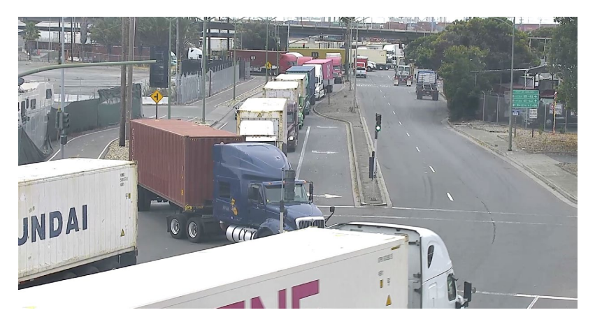
Truck queues looking south along Maritime Street towards the 7th Street/Maritime Street intersection.