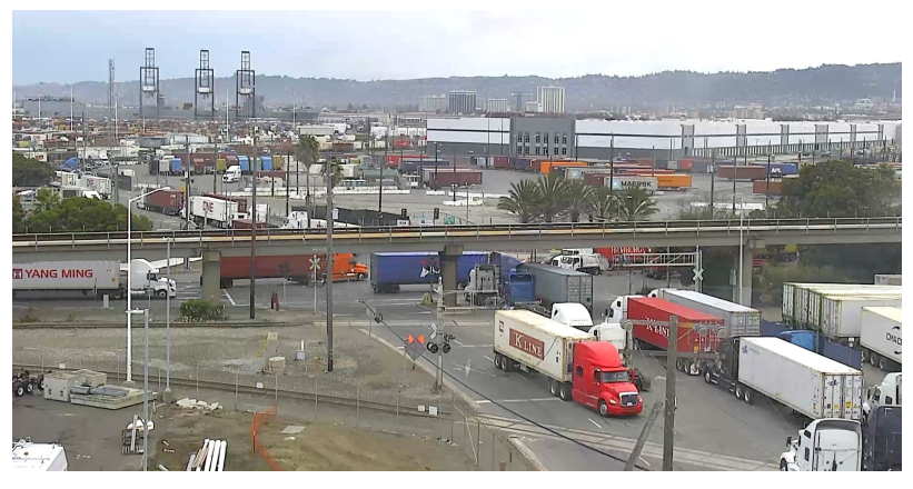
Congestion in the 7th Street/Maritime vicinity.