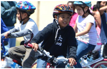
Thousand of Alameda County students participate in countywide events each year, including International Walk and Roll to School Day, the Golden Sneaker Contest, and Bike to School Day.