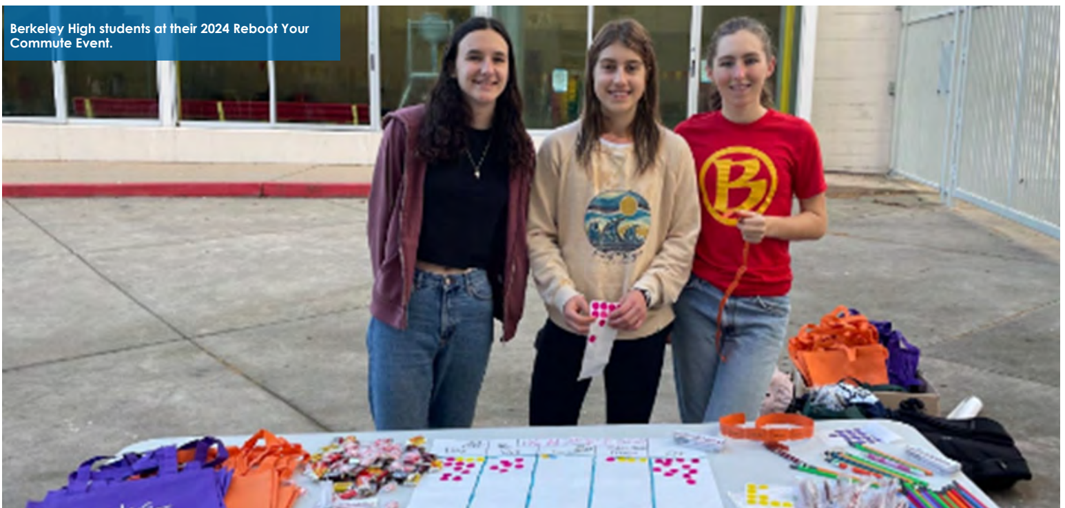
Berkeley High students at their 2024 Reboot Your Commute Event.

To learn more, please visit Alameda CTC's Legislative Program webpage , where the complete 2025 Legislative Program is posted.