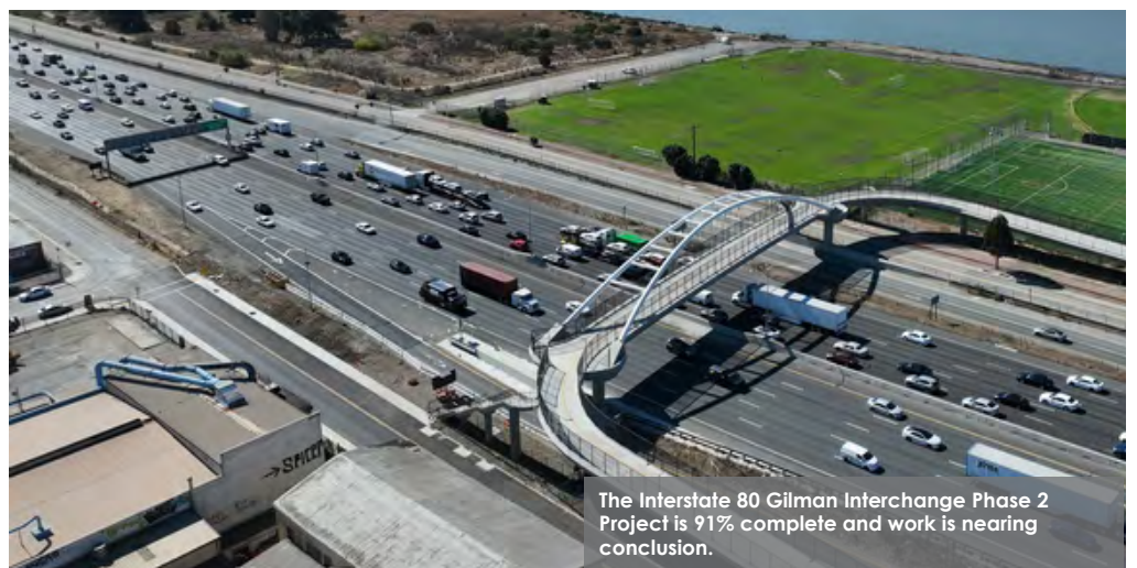
The Interstate 80 Gilman Interchange Phase 2 Project is 91% complete and work is nearing conclusion.