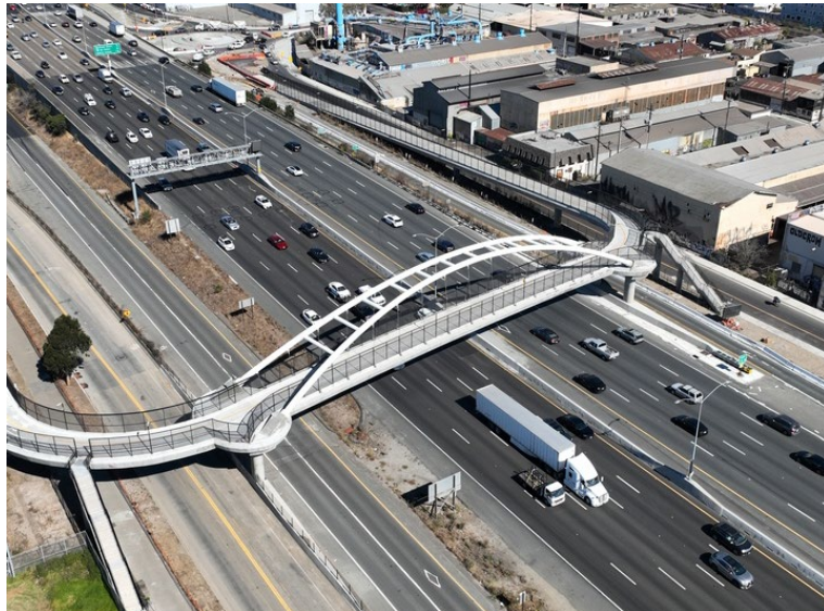
A sample stand-alone bicycle and pedestrian bridge.