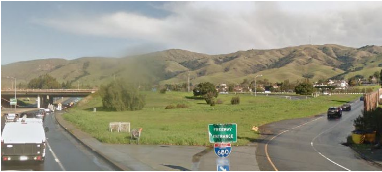
Eastbound SR-262 at the I-680 southbound on-ramp.